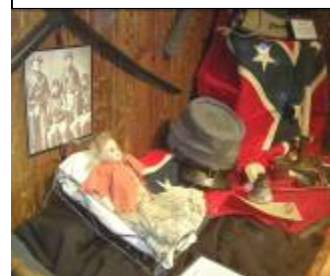
Bosque Museum Civil War Exhibit