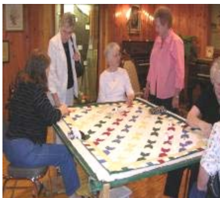
Local quilters demonstrate the art of quilting at exhibit opening.